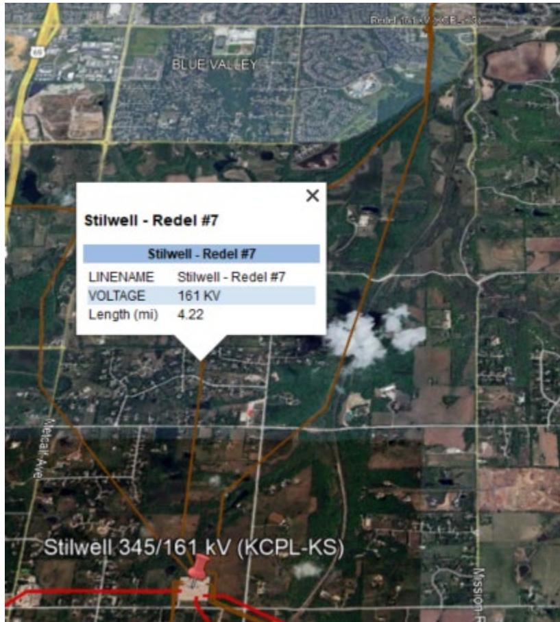
Figure 1 –Stilwell-Redel 161kV Line